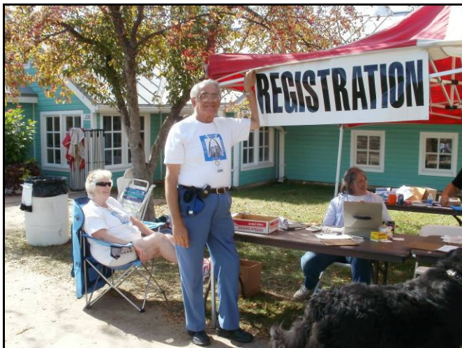
Workin' hard at the Canine Games!