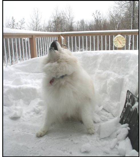
Lexi hates winter! Read more on page 2