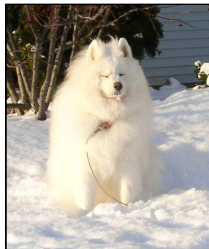
Lexi-Zen meditation in the snow